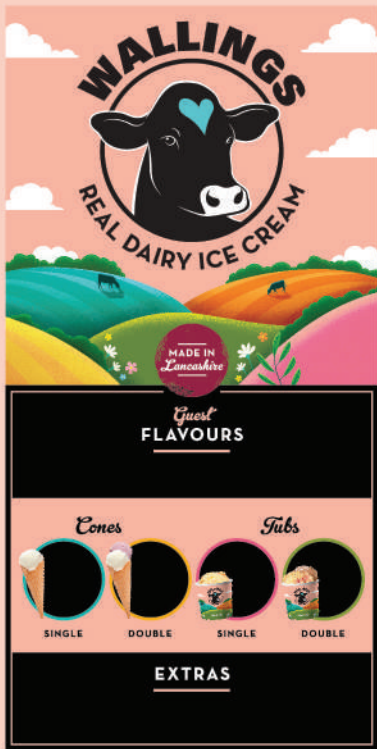
BLACKBOARD VARIOUS SIZES