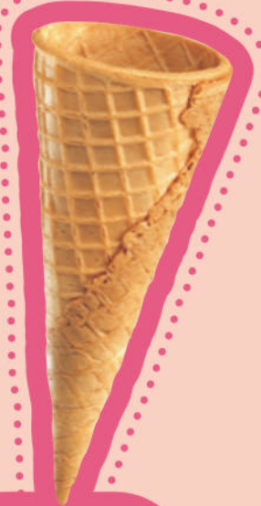
ANTONELLI SUGAR CONES (304 per box)