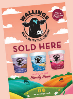
125ML TUB POSTER