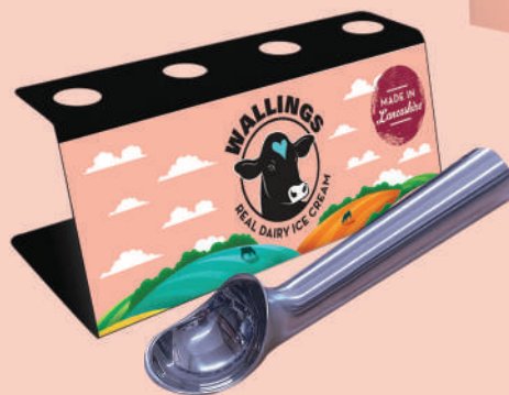
CONE HOLDER & SCOOP