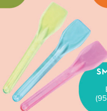
SMALL PLASTIC SPOONS Biodegradable (95mm/765 per bag)