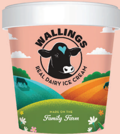
500ml POTS (50 per sleeves)