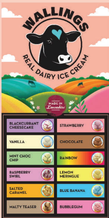
FLAVOUR BOARD 2 SIZES AVAILABLE