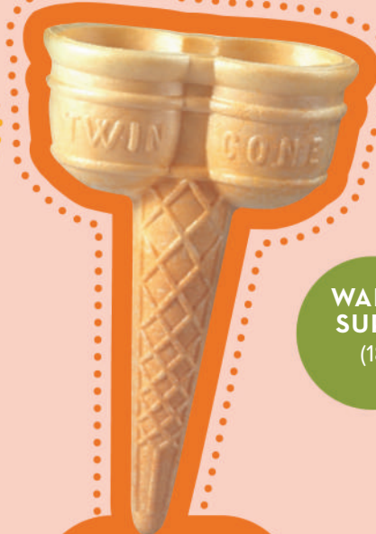
TWINTOP CONES (180 per box)