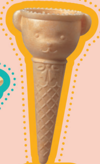
TEDDY BEAR CONES (175 per box)