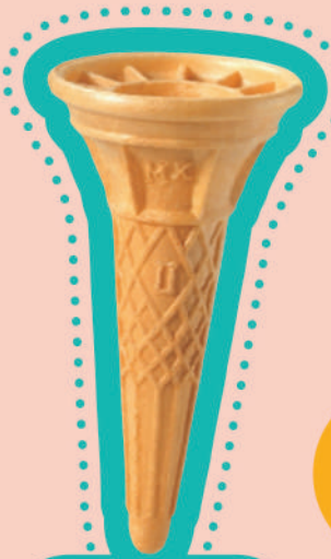
FIESTA CONES (360 per box)