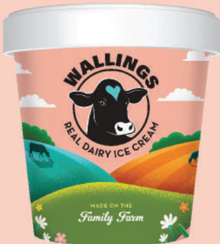
125ml POTS (46 per sleeves)