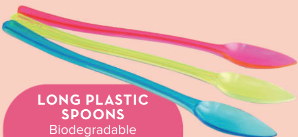
LONG PLASTIC SPOONS Biodegradable (150mm/250 per bag)