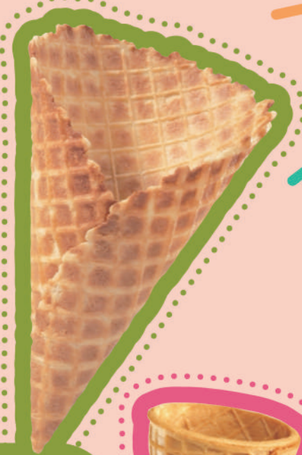
WAFFLE CONE SUPER LARGE (189 per box)