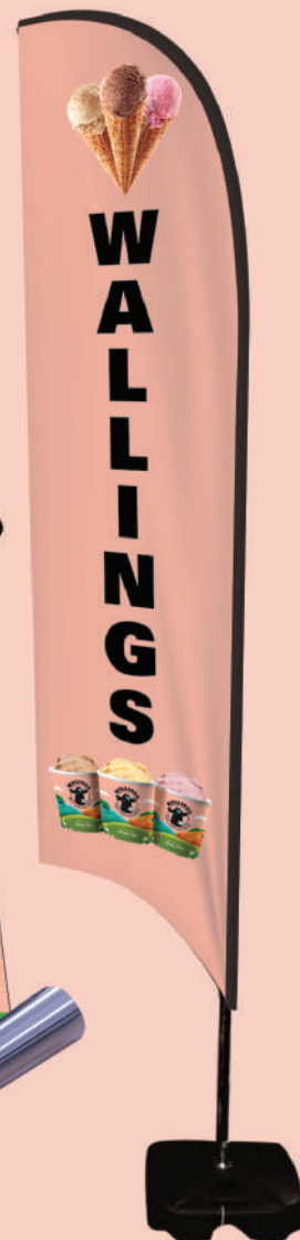
FEATHER FLAG BANNER