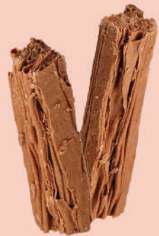
99' FLAKES (140 per box)